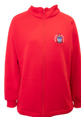
Fleecy Track Top