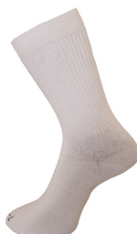
Socks Anklet 2 pk