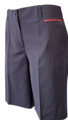
Shorts with embroidery