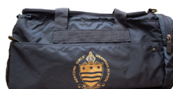
Sports Bag - Yr7-12