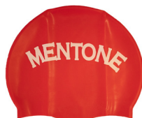
Swim Cap - School