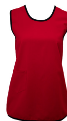
Apron - Prep Only