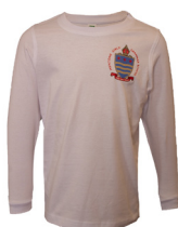
Long Sleeve Top