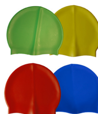
House Swim Cap