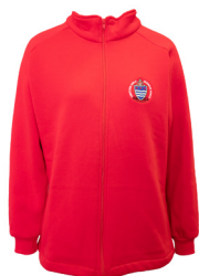
Fleecy Track Top