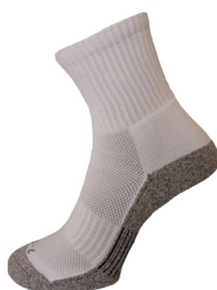
Sport Socks 2 pkt