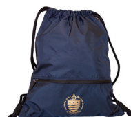
Gearsack - Prep - 6